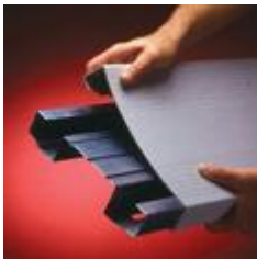
Perma-Cap Over Perma-Plank

Upgrade, restore or rejuvenate battered bleachers with Hussey Seating's Perma-Cap and Perma-Plank vinyl bleacher covers and vinyl-covered galvanized steel bleacher boards. When your school, municipal, performing arts, or sports arena bleachers need an environmentally friendly, economical alternative to total bleacher replacement, turn to Perma-Cap solid vinyl bleacher covers and Perma-Plank vinyl covered steel boards.