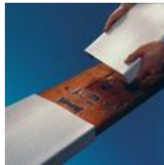
Perma-Cap Over Wood