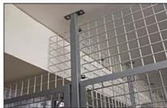
cut-outs around vents