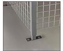
adjustable foot plates for sloped floor