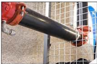
cut-outs around pipes

All panels and transoms are made of unframed 6GA & 8GA 2" x 2" electro-galvanized welded wire mesh. This innovative design allows for any necessary trimming around water pipes, wall irregularities and obstructions to be done right on-site, eliminating costly installation charges. Posts are equipped with adjustable foot plates for added strength on uneven