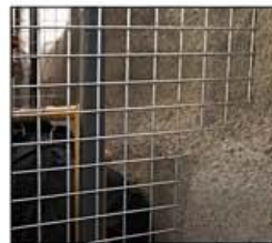
trimming around crooked walls